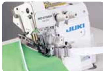
● Rolling in tape MO-6745DA-FF4-360/N077 (N077: Clean finish top and bottom)