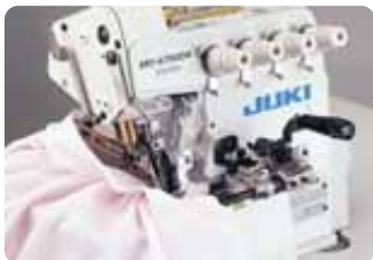
● Gathering MO-6714DA-BE6-327/S162 (S162: Swing-type gathering device, manual-lever operated)