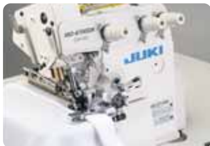
● Blind hemming MO-6705DA-0D4-210/L121 (L121: Blind stitch hemming attachment)